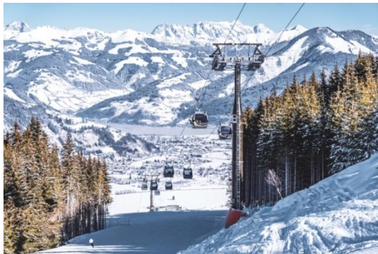
Photo: From the glacier directly to the town center of Kaprun

With the MK Maiskogelbahn, the first stage of K-ONNECTION Kaprun – Maiskogel – Kitzsteinhorn was opened in December 2018. The 10-passenger single-cable gondola provides outstanding access to the family mountain just outside of town.